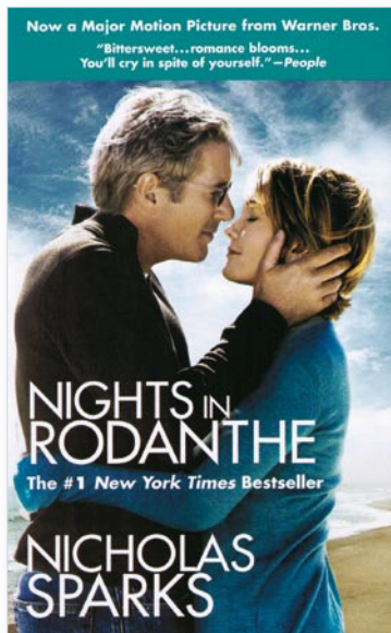
Nights in Rodanthe by Nicholas Sparks

Enter Paul Flanner, a 54-year-old workaholic surgeon whose wife has left him. Bewildered by the hand life has dealt him, Paul sells his medical practice and heads off in search of some resolution for his soul.