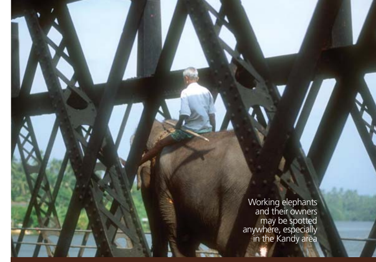
Working elephants and their owners may be spotted anywhere, especially in the Kandy area

Yala West is a mixture of scrub, plains, lagoons, and rocky outcrops. Though not in the same league as Africa's safari parks, there are elephant, bears, deer, crocodiles, wild boar, monkeys, wild buffalos, wild peacocks and a small population of elusive leopards calling it home. Later that evening back at our accommodation after a satisfying day's wildlife spotting, its time to order a chilled Lion beer or perhaps an arrack cocktail – somehow a cup of tea doesn't seem to fit the occasion quite the same. ■